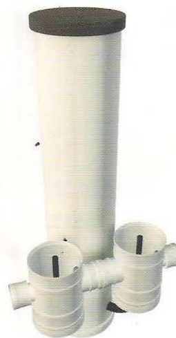
Builder's Kit (GFPS-A)