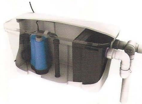
G-Flow complete Plug & Play (GFGF)